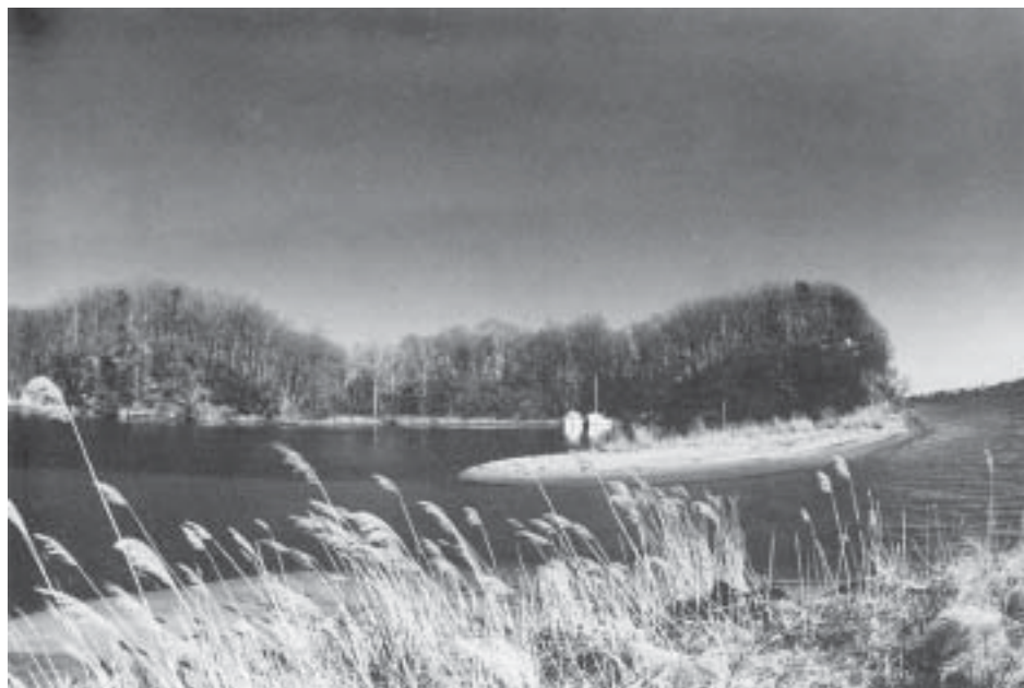
Too often, land owners who acquire their "Ponderosa" of beautiful natural shoreline want to shore it up with impervious stone. What if the whole river could look again like Winchester Pond, above?

As crabs supplanted oysters as the main cash crop, and less weed was around, due to the catastrophic impact of Hurricane Agnes, we began to see utility in sea weeds and a connection between weeds and the health of the fishery. Another, perhaps little-known fact is the State-run practice of killing seaweed. That was only 30 or so years ago. In fact, the statute to permit the harvest of SAV remains on the Maryland law books, although I doubt if a permit is still available.