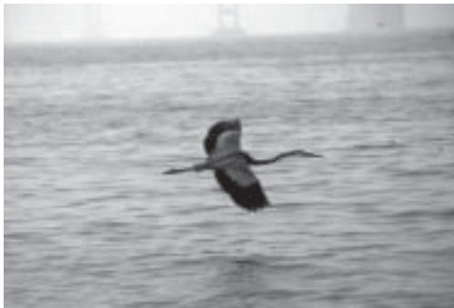
"The piercing sckrawk of an angry blue heron..." One of the Bay features so common we take them for granted.